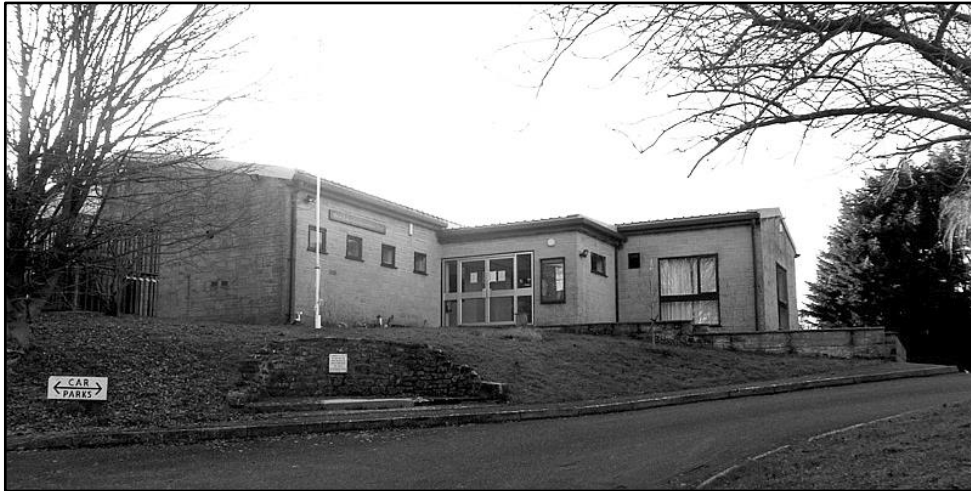
West Coker Commemoration Hall

Grid Reference: ST51381354 [50.9193N, 2.6930W]