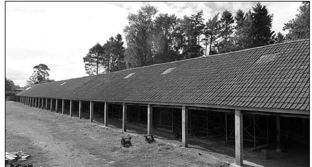
Dawes Twine Works undergoing renovation

SIAS extends a cordial invitation to anyone interested in Industrial Archaeology to attend the Conference at West Coker Commemoration Hall and to go on the accompanying tour of the award-winning and newly restored Dawe's Twine Works .