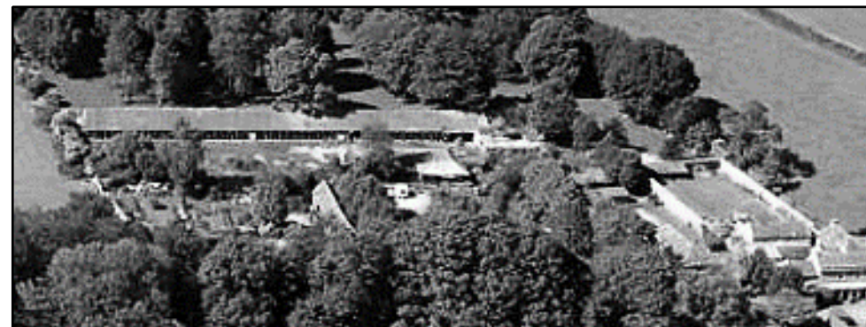
Dawes Twine Works from the Air

Clapton Mill - One of the most complete grain mills in Britain, driven by two streams, and a turbine